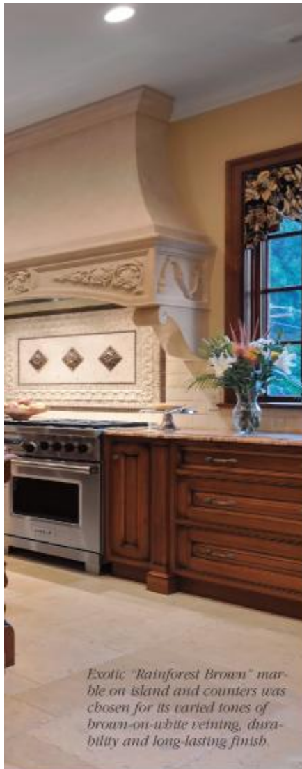
Exotic "Rainforest Brown" marble on island and counters was chosen for its varied tones of brown-on-white veining, durability and long-lasting finish.

One of the first design elements Starck showed them for the kitchen was a magnificent reproduction 18th-century French range hood. It perfectly fit the "old world charm" of the French Manor style the couple had chosen for their home.