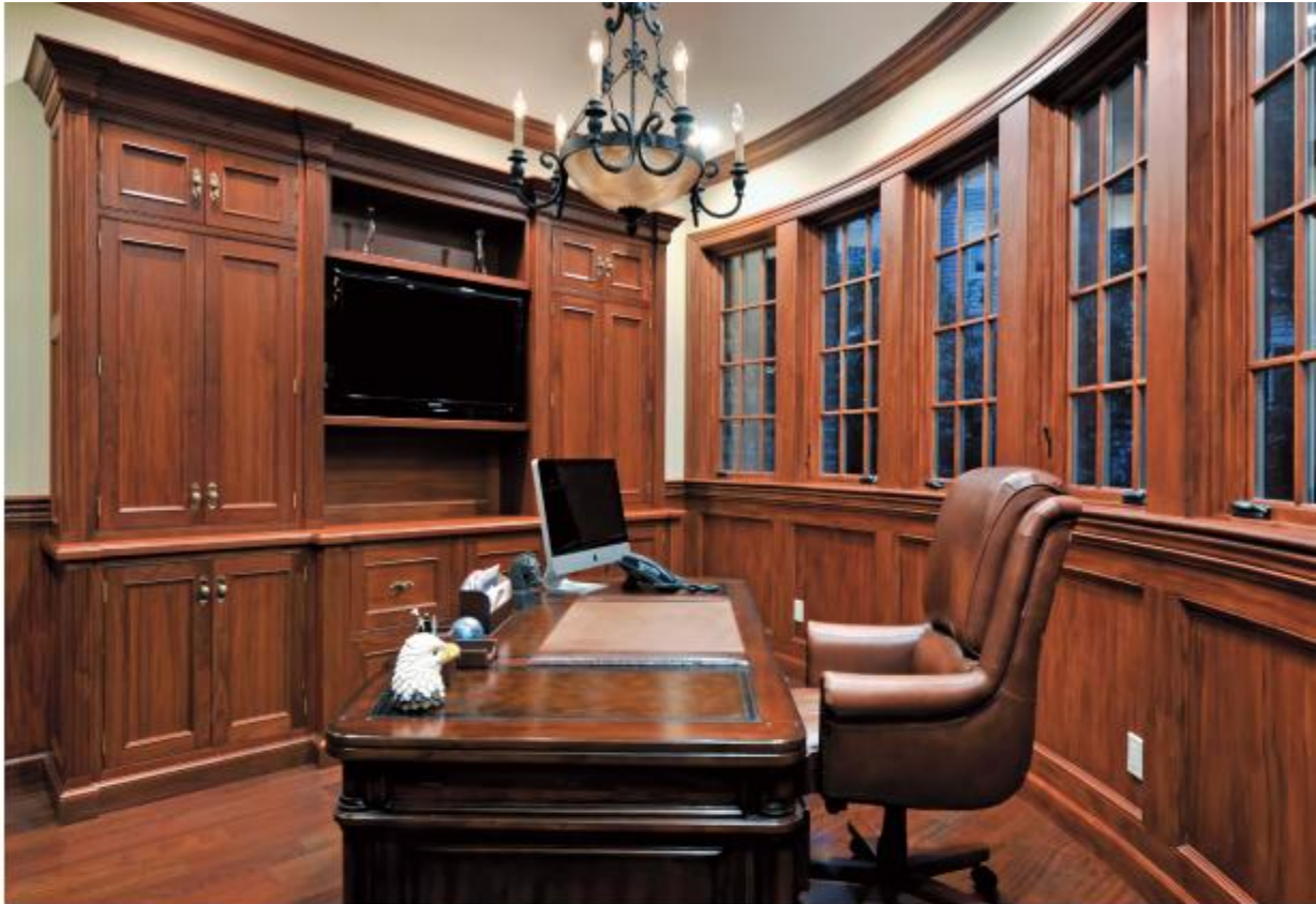
Above, Showcase Kitchens' custom cabinetry appears to be natural extension of wainscoting and window framing.