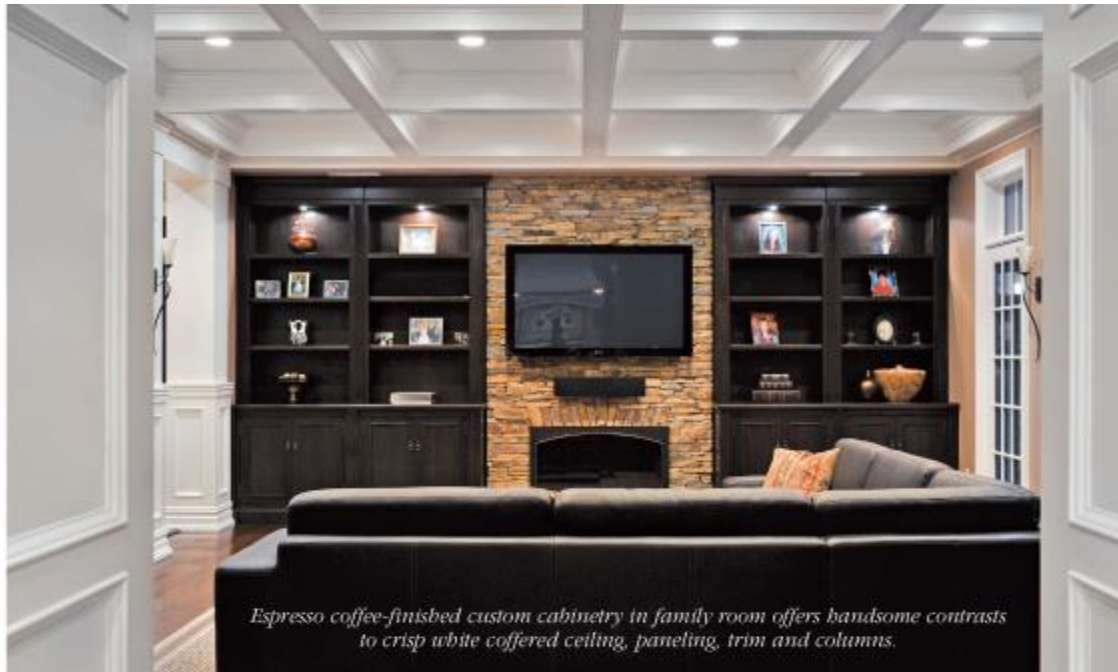
Espresso coffee-finished custom cabinetry in family room offers handsome contrasts to crisp white coffered ceiling, paneling, trim and columns.