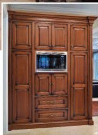
Elegant stand-alone custom cabinet has been fitted with microwave