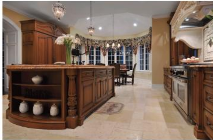
Kitchen floor in light gold and beige tones was crafted of thick vintage "Biblical Stone" reclaimed from streets in Jerusalem.