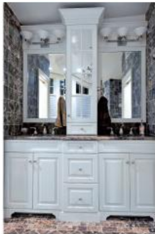
Left, in addition to creating separation between master bath's double basins, column shape of medicine cabinet repeats motif expressed elsewhere in home.

flanks the hearth, is not only ideal for media storage and displaying family collections, but it helps concentrate focus on the fireplace.