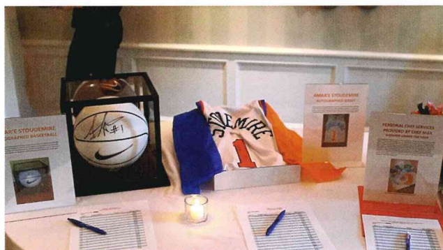
Amar'e Stoudemire Auction items